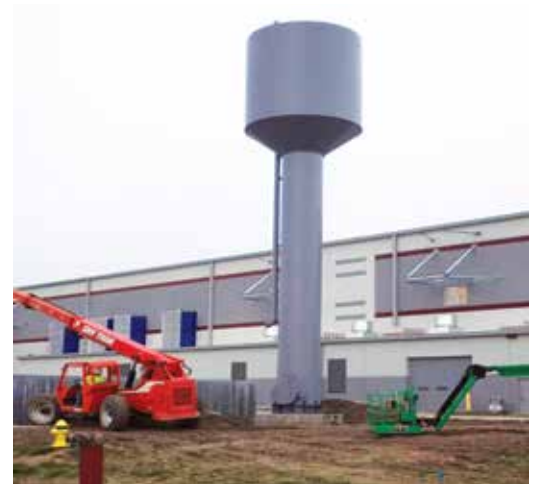
10,000 gallon custom-made elevated water tower located in Indiana.

Our facilities have the machinery and craftsmanship to bring your ideas to life. Shop-built Tanks, Pressed Heads, Support Structures, Mezzanines, Antenna Mounts, Ice Bridges, Stair Towers, Conveyors Trusses, and Bridges , are all examples of what we have fabricated for industries such as material handling, oil/gas, electric generation, bio-mass, aviation, water and wastewater treatment, grain, fertilizer, mining, and sand and gravel . Steel plates can be cut to shape and pressed or rolled up to 2" thickness. We also have a custom paint line that allows for Wheelabrating weldments up to 11'x4' with a stop in one of the largest environmentally-controlled paint rooms in the nation for coating applications. The structural shop is complete with a CNC beam line, multiple CHC angle lines, a CNC saw line, and several designated custom fabrication areas.