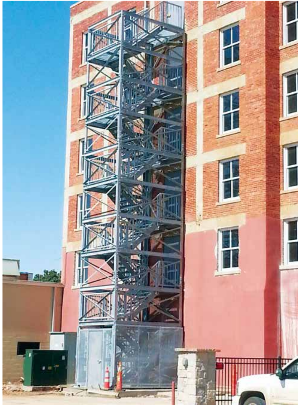
Custom stair tower, located in Oklahoma.