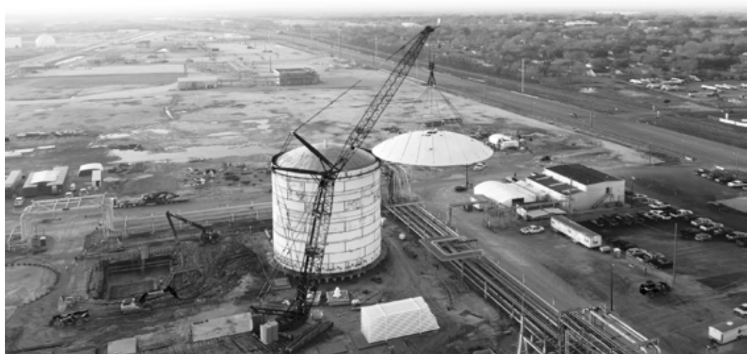
LN-225 Cryogenic Tank Installation in Texas.

We help you get more value from your tank at every stage of its life. From design to maintenance, from extending functionality to extending your tank's useful life, PTTG specializes in helping you leverage this critical asset.