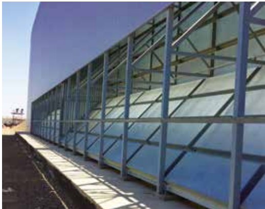
Saudi Arabia Airport Facility.