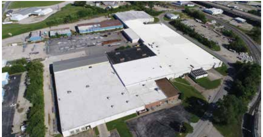
Allstate Tower plant located in Henderson, Kentucky. 275,000 sq. ft. facility on 13 acres.