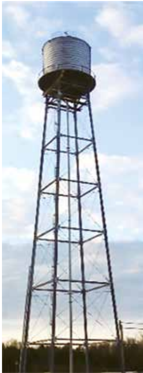
65,000 gallon COBRA-EWT in Kentucky.