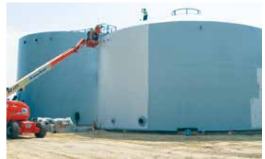
750,000 gallon GST's in New York.

PTTG looks no further than under our own roof for experienced and innovative engineers to design tanks, towers, and support structures that fit the visions and needs of our customers. Our in-house engineers, decorated with domestic and international licenses as well as Ph.D.'s, are fluent in storage tank, tower, and support structure standards, including API-650/620, AWWA D-100, NFPA-22, Factory Mutual, EIA/TIA, ASCE, AISC, IBC, AWS, and ACI-318 . Their expertise in this expansive list of industry standards enables quick and accurate turnaround on calculations and drawings, as well as foundation loads and civil design. As committee members and active supporters of API, AWWA, and NFPA, updates and changes to evolving industry standards are not lost on us. As the industries we serve grow and advance, our engineering team grows and advances right alongside them. Whether a project is typical or highly specialized, domestic or international, big or small, our team is up to the challenge of providing the sound engineering you need to make it a success.