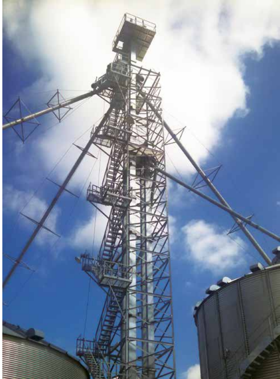
115' Support Tower with switchback stairs in Kentucky.

In addition to our standard product lines, we also fabricate many customized structures for various industries.