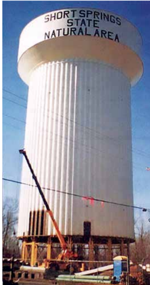
Water tank raising in Tullahoma, Tennessee. This 2-million-gal., 750-ton hydropillar was the largest elevated water tank raised at the time (2003).

Our detailed inspection reports identify any tank issues, as well as targeted solutions for your needs. We offer ROV and dry cleanouts.