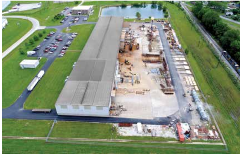
Pittsburg Tank & Tower manufacturing facility located in Henderson, Kentucky. 110,000 sq. ft. facility on 22 acres.

We deliver better quality, a superior working experience, and greater lifetime value from our products and services, which enables our partners to think bigger, be bolder, and accomplish more than they ever have.