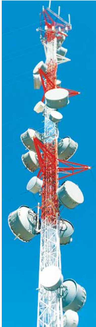
Before and after Allstate painted 240' guyed tower in California.