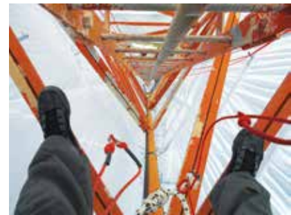
Painting of 827' tower in Italy. Photo below shows the outside view of the project while in progress.