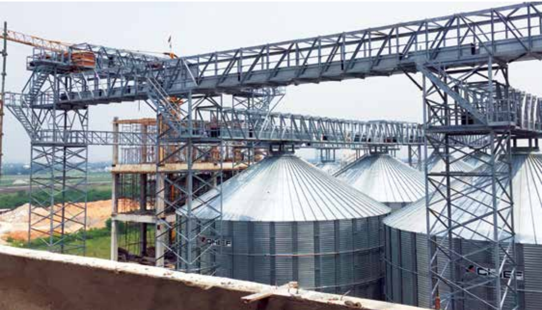
Grain terminal constructed in Indonesia. 120,000 BPH capacity, 1,154 ft. of catwalk and eight towers.

Since 1919, our family has had a passion for fabricating steel. Starting with ground and elevated water tanks, then adding communication and broadcast towers to support the growth of the industry needs. Our latest product is support systems.