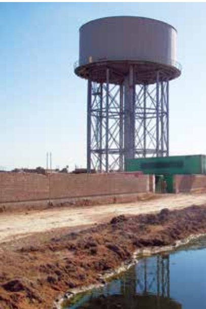
900,000 gallon elevated bolted tank constructed in Nasiriyah, Iraq.