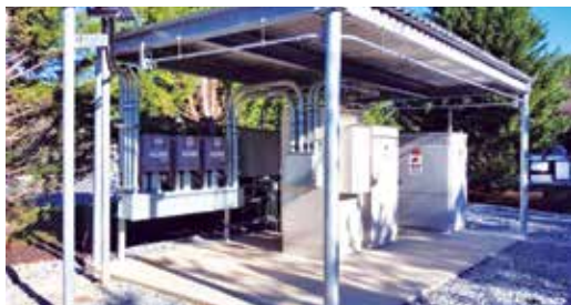
A custom-built ice shield for a communication cabinet.

We welcome new and challenging design ideas. Simply put, if you need a product made of plate and/or structural steel, we would love to earn your business.