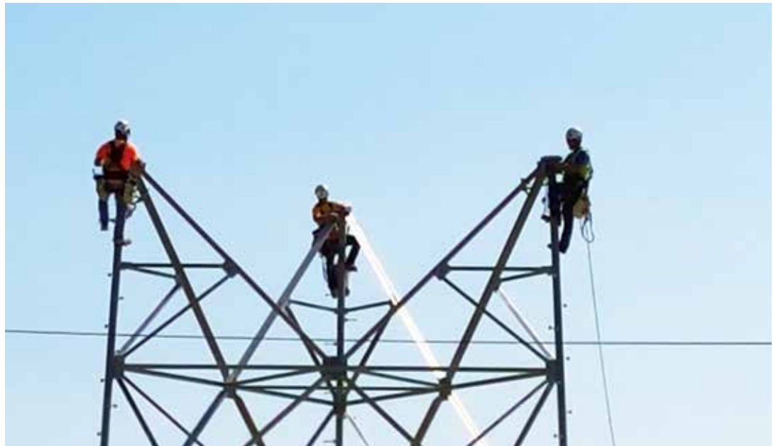
Installation of 911 Emergency System in Kentucky.

Our equipment, facility, technicians, and design-build business model allow tower projects to be expedited in a cost effective manner. From engineering and manufacturing to modification and site demolition, we repeatedly deliver the safety, product quality and workmanship our clients have come to expect.