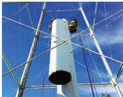
Riser replacement on 200,000 gallon EWT in Texas.