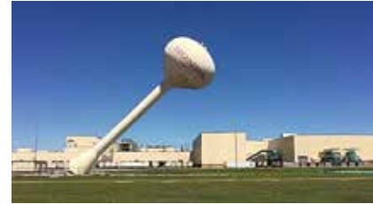
Tank Dismantle 600,000 gallon Sphere, Georgia.

alterations and reconditioning . To be assured your tanks and towers are in safe and productive working order and in compliance with the latest Federal, State, local and industry safety and environmental regulations and codes, allow PTTG to inspect and advise you of your assets' condition.