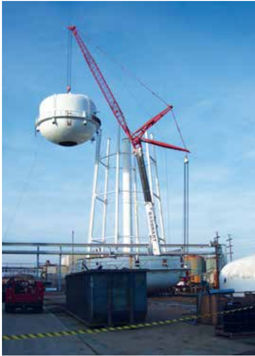
Container replacement in Tennessee.